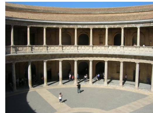
Patio of the Palace of Charles V

Tourist Information Office . Open from 9.00am to 8pm Monday to Saturday and 9.00am to 2pm on Sundays and public holidays (until 14th October). http://en.granadatur.com/